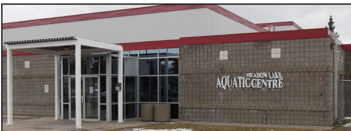
The Meadow Lake Aquatic Centre