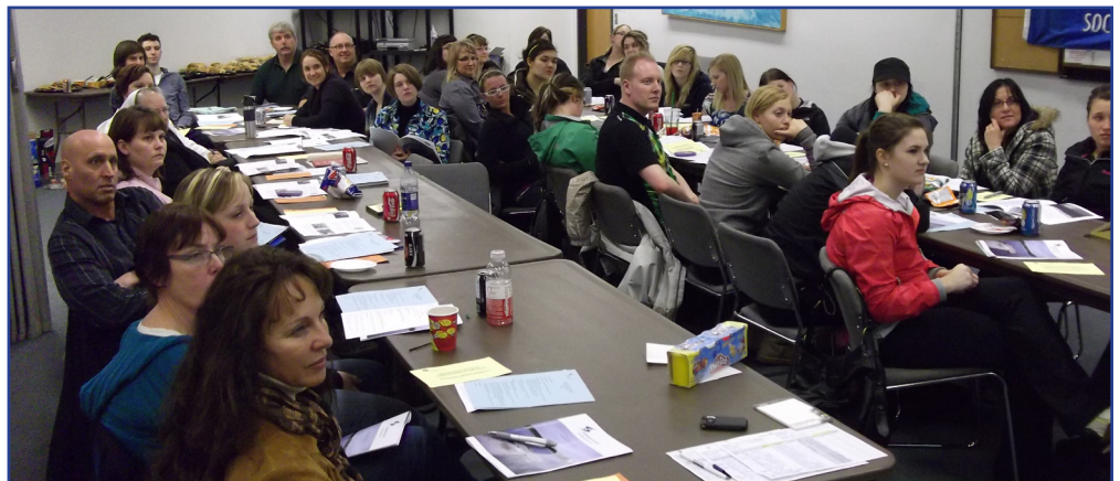
Participants at the Informational Meeting in Saskatoon on March 26th.

responsibilities of instructors and examiners as well as general networking. The third and final Instructor Trainer Update was also held on March 26th which familiarized our Instructor Trainers and Apprentices on the new Swim for Life and Swim Patrol programs.