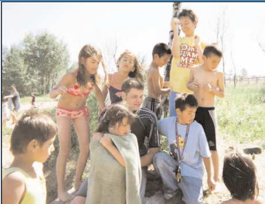
A Water Smart® discussion in Pinehouse